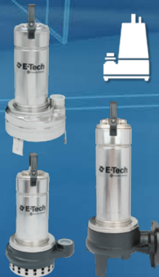
ED - EDV - EGT - EGF up to 36 m 3 /h, 20 m