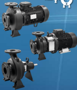
FNC - FNS - FNE up to 240 m 3 /h, 100 m