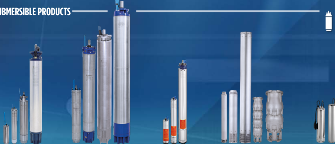
ENCAPSULATED MOTORS 4"/6"/8" up to 150 kW