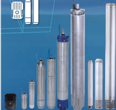
4"/6"/8"/10" HIGH EFFICIENCY SYSTEM up to 250 kW